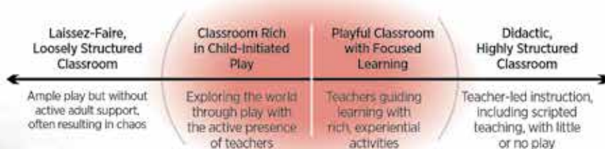
Figure 1. Early Childhood Instructional Continuum 10

skills that the CCLS promote. Schools can help parents to know about what their children are learning, what they enjoy, and what they have mastered. In short, the CCLS' new and rigorous expectations for students' learning reinforce the need for strong collaboration between schools and families in support of children's learning.